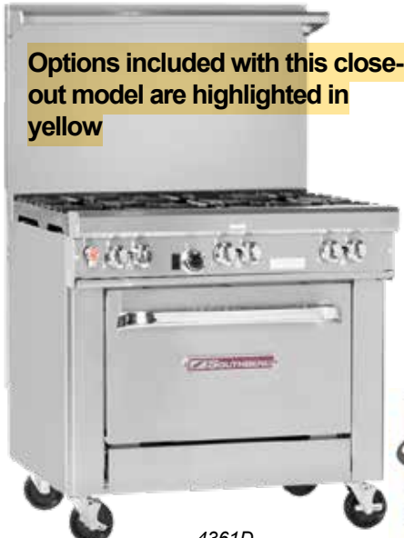
4361D (shown with optional casters)

Configure your own custom spec sheet and model number at www.BuildMyRange.com . Refer to AutoQuotes for list pricing.